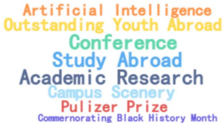
Figure 1: Top 20 Keywords of Popular Content of Each University