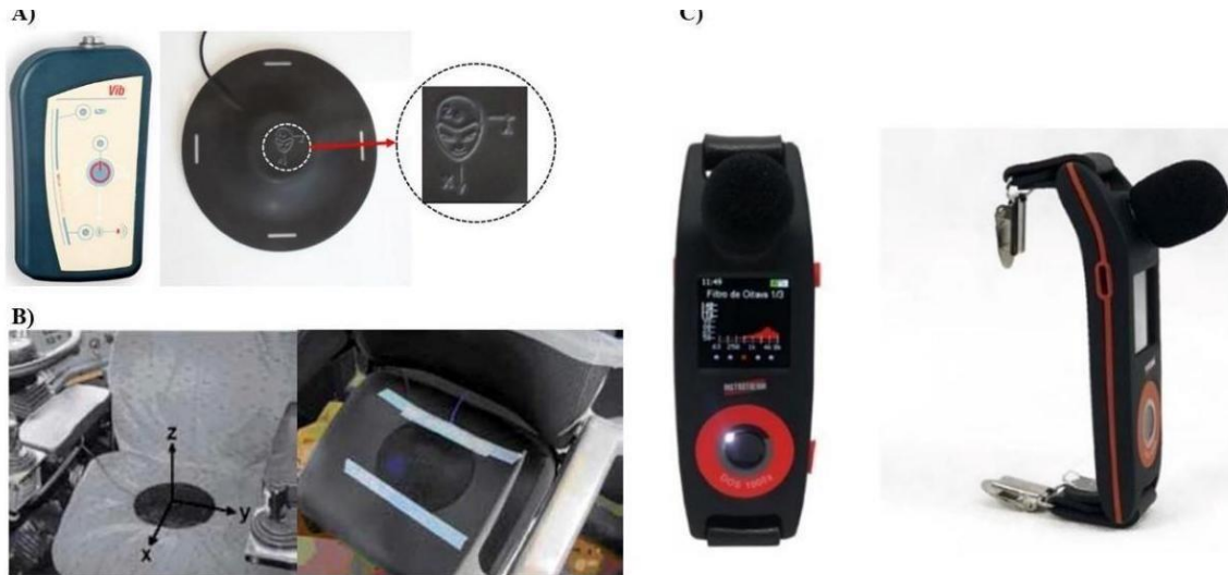
Figure 2: VIB008 Vibration Meter (A), Transducer mounting direction according to the orthogonal "x", "y", and "z" axes and transducer fixation on the operator's seat (B), and DOS 1000 Noise Meter, Instruthermo

Noise level acquisition was performed using a personal integrating meter (dosimeter), model DOS 1000, brand Instrutherm®, with an octave band filter, datalogger function, configured with "A" weighting circuit, slow response circuit, reference criterion 85 dB (A), integration threshold 80 dB (A), and doubling increments q-5 and q-3, to simultaneously meet the criteria of NR 15 and NHO 01 (Figure 2C).