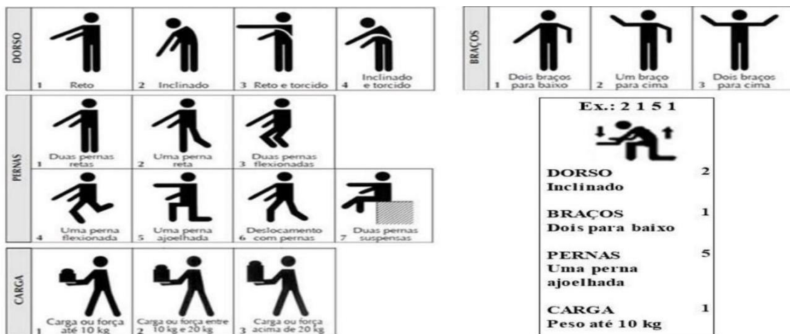
Figure 3: Posture recording system using the Ovako Working Posture Analysing Systems (OWAS) method.

Postural assessment was performed using the Ovako Working Posture Analysing System (OWAS) practical recording system. This method evaluates work demand based on the positions of the back, arms, legs, and load lifting (Figure 3) (Brandl; Mertens; Schlick, 2017; Enez; Nalbantoglu, 2019).