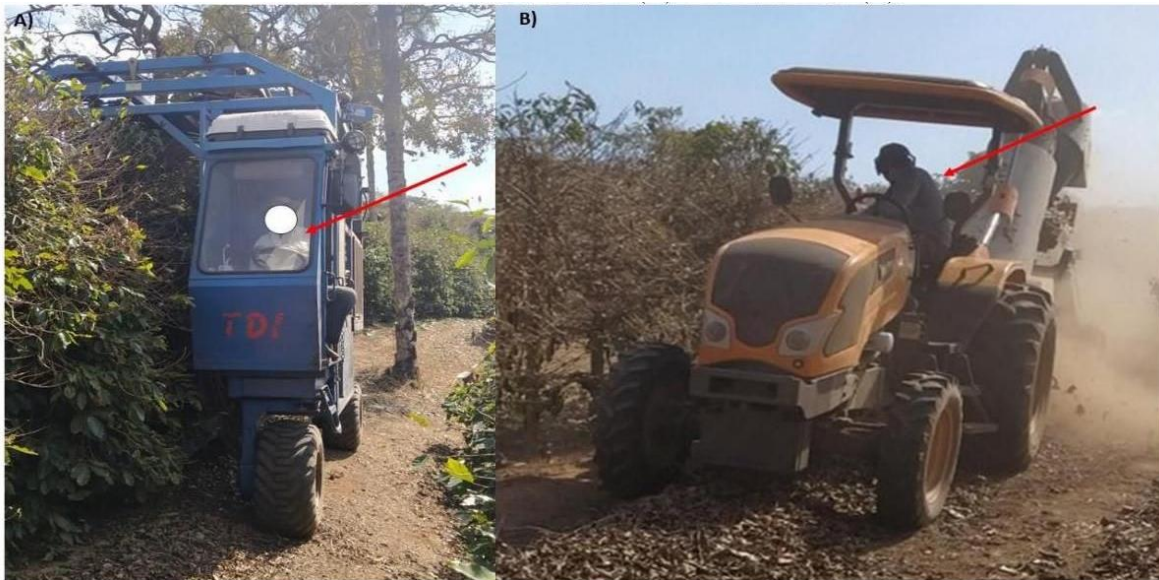
Figure 4: Typical positions of operators in the harvester and tractorized assembly used in the mechanized harvesting of the coffee pot: Harvesting (A) and Harvesting (B).

With the postures recorded for each stage of mechanical coffee harvesting, it was possible to combine them to perform the classification analysis according to Table 3.